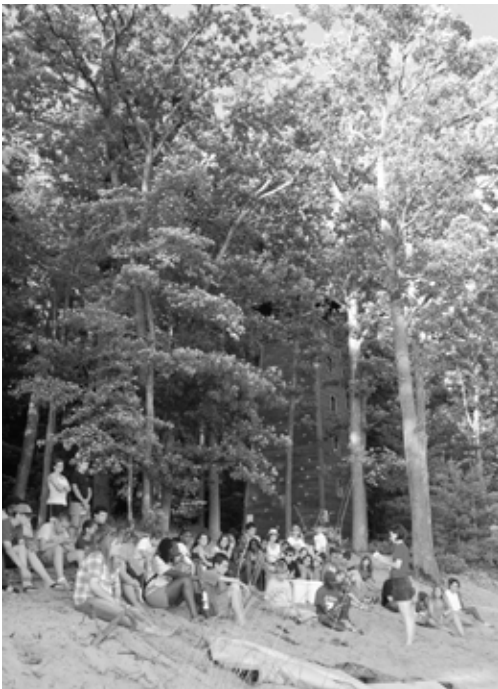
Evening vespers on the beach was both powerful and popular this summer.

INSIDE Legacy campers...10 Things Learned...Staff spotlight...Thank you!...Online Auction Nov. 18- Dec. 2