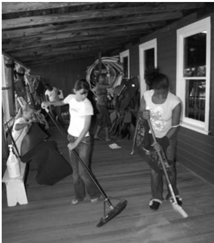
Capers on the Dining Hall porch still include sweeping and tidying the waterfront items every day!