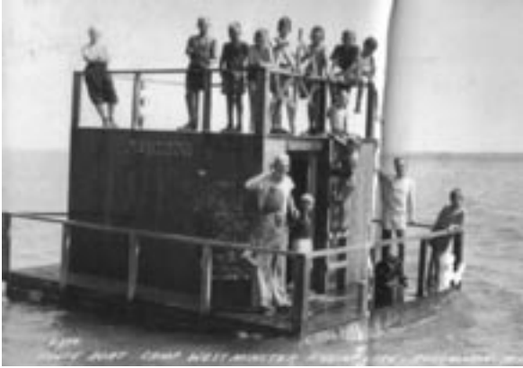
Campers enjoy the camp houseboat, the Westminny, on Higgins Lake in the 1930s.